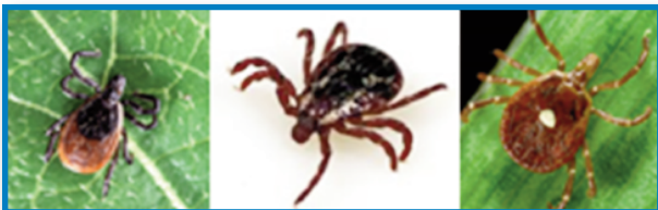
Black-legged “deer” tick